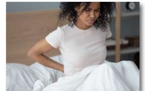
A lumpy, sagging mattress contorts your body. Most sleep experts say after seven years it's time to go mattress shopping.

One reason may be that those who are upset or anxious are more likely to tense back muscles. In general, 'if