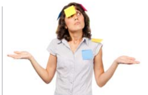
How good is your memory? Thousands of companies are wagering that your memory is shaky.

"Free trial" How good is your memory? Thousands of companies are wagering that your memory is shaky. When they have phrases like "We will not charge your credit card until after your free 60 day trial", it means they are betting you will forget to cancel at 59 days.