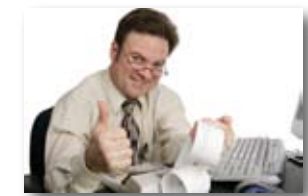
For the majority of people, Social Security benefits are not taxable.

Up to 50% of your SSDI is taxable if your income is more than those amounts. Also, up to 85% of your SSDI is taxable if one-half of your SSDI plus all your other income is more than: