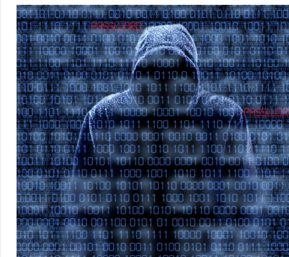
Once thieves have your personal information, they can use it to commit all kinds of fraud.

In one case, reported on www.ssa.gov , "an 86-year-old man received a letter saying he had won $3.5 million and that he should call the included phone number to provide necessary information for receiving the money. Soon after calling, the man did not receive his scheduled Social Security payment, so he contacted SSA, only to learn that his benefits were diverted to a different account. He was issued a replacement payment, but the man