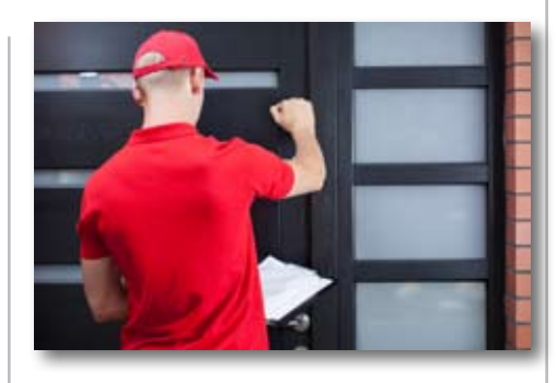
Just as the better weather brings people out their homes, it also brings out a spate of unscrupulous home improvement contractors.

The Summer Job Scam. Summertime ushers in onrush of kids who are out-of-school and looking for work. Unfortunately there is also an onrush of con artists who are looking to take advantage of them. One scam is to get young applicants to give up personal information like their Social Security number for alleged 'tax purposes'. Much too late, kids find out that their identities have been stolen. The best defense is to run a thorough background check on any company offering employment and to remember that an employer would only need your Social Security number