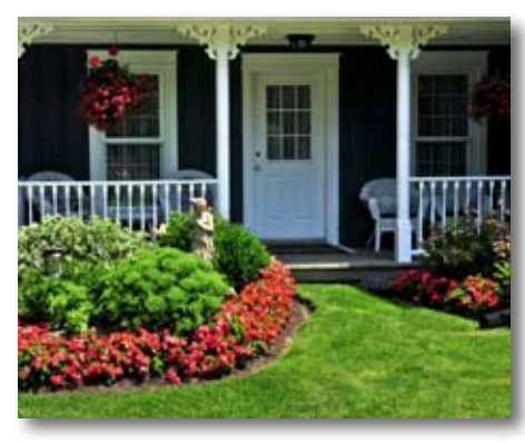
Basic efforts like improving the landscaping can add real value to your home.

Basic efforts like improving the landscaping can add real value to your home. Many real estate experts say that refreshing your mulch, trimming shrubs, and planting colorful flowers will return more than 100% of the cost of these simple projects—many of which you can do yourself. For an updated look to your home's exterior, consider adding stone veneer to the front of your house which also has a very good payback rate. Wood decks have a good return on investment but backyard patios do very poorly, returning only about 48% according to Remodeling Magazine .