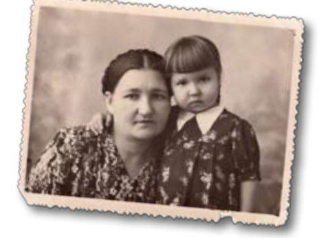
DNA testing can tell us what our "origin stories" are and can connect us to people who share our DNA.

to keep in mind that DNA results are not a diagnosis. The results only tell you about risk—that is the likelihood of a possible disease or disorder. You should discuss any findings about your health risks with your doctor.