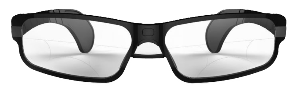
These Dynafocals are a new breakthrough in wearable technology will allow you to instantly shift your focus from close up to far away without putting a strain on your neck.

10855 West Dodge Road, Suite #101 Omaha, NE 68154 cuddiganlaw.com 402.933.5318