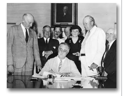
August 14, 1935 — FDR signs the most important law of his New Deal: the Social Security Act.

While Social Security is a part of our social fabric, that doesn't mean that we can take its future for granted. As we celebrate the 80th anniversary of Social Security, this is the time to ensure that the Social Security programs remain strong for the next generation. Now more than ever, as an increasing number of workers approach retirement, we cannot afford to jeopardize the stability it provides