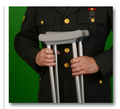
As a disabled vet you can receive Veterans Administration disability benefits and Social Security disability benefits at the same time, if you meet eligibility requirements.

If you are a disabled vet you can receive