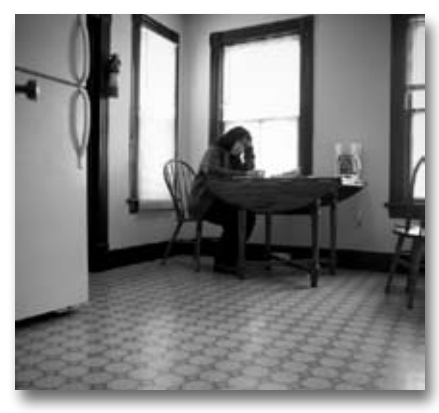
"The average time it takes Social Security to process a disability claim is 422 days which, more often than not, is a real hardship for disabled workers who may have very little or even no income."

The disability claims backlog has been a long-standing problem dating as far back as when Gerald Ford was president. In 1975 Congress raised an alarm about "a huge backlog" when the number of cases went above 100,000. Since then