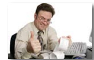
For the majority of people, Social Security benefits are not taxable.

Up to 50% of your SSDI is taxable if your income is more than those amounts. Also, up to 85% of your SSDI is taxable if one-half of your SSDI plus all your other income is more than: