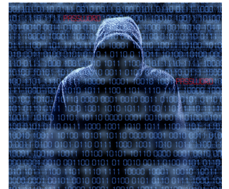
Once thieves have your personal information, they can use it to commit all kinds of fraud.

In one case, reported on www.ssa.gov , "an 86-year-old man received a letter saying he had won $3.5 million and that he should call the included phone number to provide necessary information for receiving the money. Soon after calling, the man did not receive his scheduled Social Security payment, so he contacted SSA, only to learn that his benefits were diverted to a different account. He was issued a replacement payment, but the man