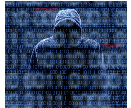
Once thieves have your personal information, they can use it to commit all kinds of fraud.

In one case, reported on www.ssa.gov , "an 86-year-old man received a letter saying he had won $3.5 million and that he should call the included phone number to provide necessary information for receiving the money. Soon after calling, the man did not receive his scheduled Social Security payment, so he contacted SSA, only to learn that his benefits were diverted to a different account. He was issued a replacement payment, but the man