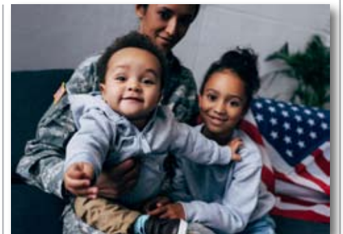
Military service members and their families can get easy access to free tax software from H&R Block through a Department of Defense program.

MilTax. Military service members and their families can get easy access to free