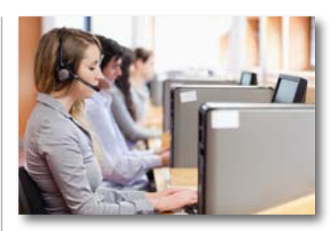
Get the customer service rep on your side by being polite.

buying, try to get the employee's name and an order number."